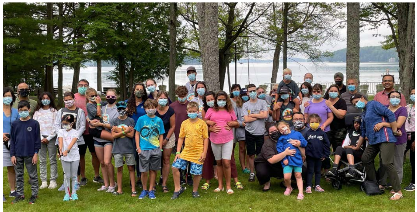
Friends and family experience CNIB Lake Joe's first-ever Holiday Week, August 2021.

This program was a huge success, with 100 guests joining in the summer fun! Thanks to the launch of pre-camp virtual meetings, everyone arrived ready and raring to go. The photo below is of all our guests outside on the last day of Holiday Week #1. We can't see the smiles behind the masks, but we know they're there!