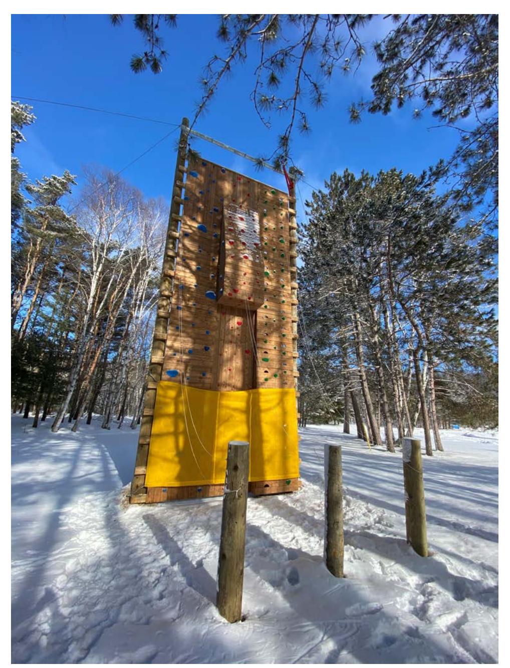
The accessible climbing tower stands 32' high with a climbing surface that is 12' wide and comes with leading-edge safety equipment.

• Phase one of CNIB Lake Joe's Adventure Zone is complete with the addition of an accessible climbing tower . The structure includes various climbing options with harness and safety devices for guests of all abilities.