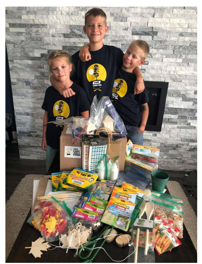
Young campers show off their Camp-in-a-Box contents.

With $10,000 in funding from the Military Police Fund for Blind Children, we created our first-ever CNIBLakeJoe@Home Camp-in-a-Box program . One hundred children (ages 6-18) from across Canada registered for four weeks of summer programming, all at no cost to families.