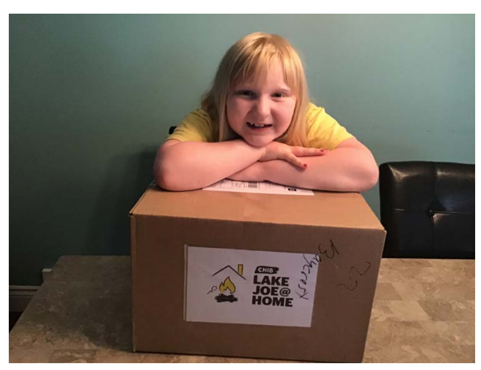
A young CNIB Lake Joe camper smiling, about to open her summer Camp-in-a-Box.