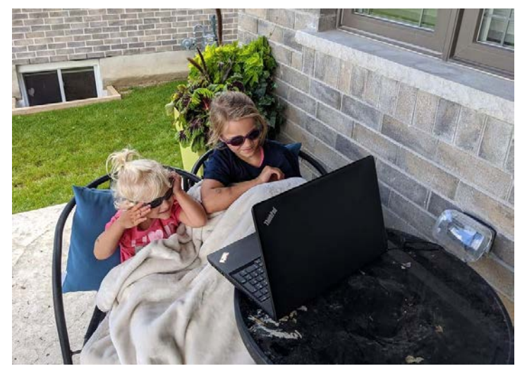
Two girls participating in CNIB Lake Joe Campin-a-Box Zoom sessions outside in the fresh air.

"The kids had such an amazing time over the last few weeks through the Camp-in-a-Box program. It was so nice to connect with past camp counsellors/friends and meet new ones. Thank you to everyone involved for such an amazing experience in uncertain times."