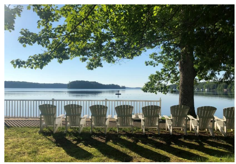
The beach at CNIB Lake Joe. The perfect place to relax.