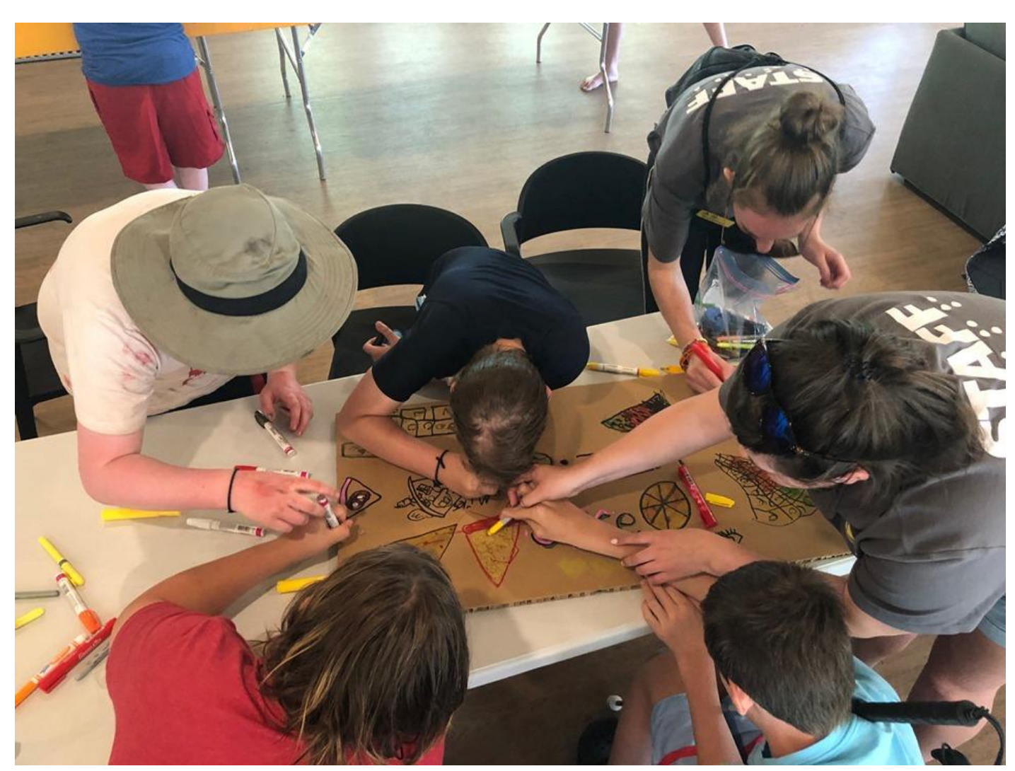
It's all about the team! Campers work together to design a "cabin flag".