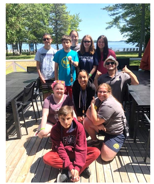
Counsellors in Training 2019 team (with staff) helping to support and facilitate programs.