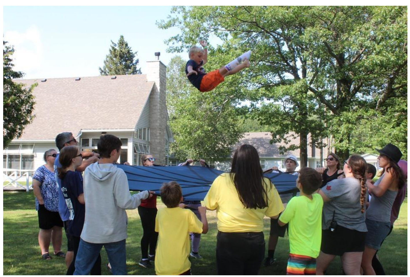
A young boy experiences the Inuit Blanket Toss.