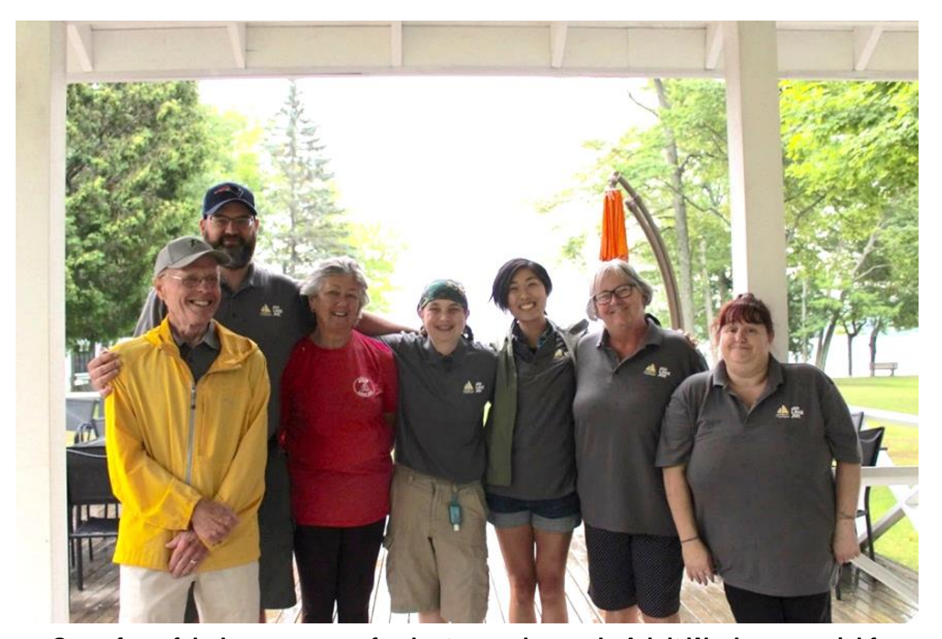
One of our fabulous groups of volunteers who made Adult Week so special for our guests!

Twenty-three dedicated camp volunteers gave more than 1,090 hours of service to ensure every camper had the best possible experience at CNIB Lake Joe, often volunteering for a full week (or more!) at a time.