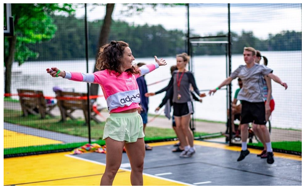
CampAbilities volunteer leads an exercise group on the multisport court.